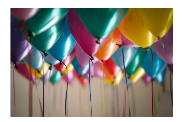
June Birthdays and Anniversaries